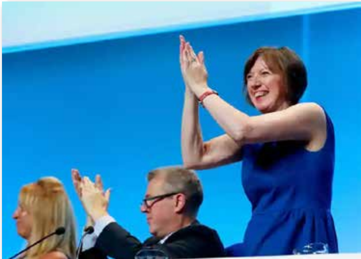
Frances O'Grady, TUC conference 2019

Launching the report, O'Grady said 'there's a panic on the hard right' over the ideas of a far stronger role for the state, 'but the welfare safety net had to be restrung, and our public services rebuilt...We don't want to the government to reach for the Golden Oldie of austerity and deregulation.' Instead, we need an intelligent industrial strategy, building UK supply chains, and a new business models based on fairer employment relationships.