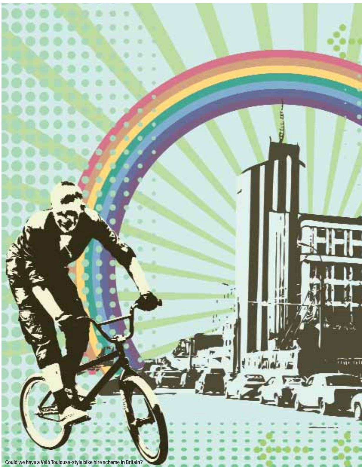
Could we have a Vélo Toulouse-style bike hire scheme in Britain?