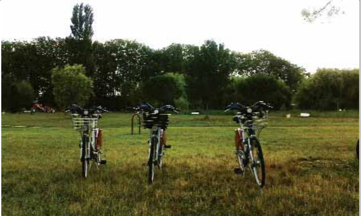
Above: Get your bikes ready for summer 2010

► investment, which many conventional public transport schemes need.