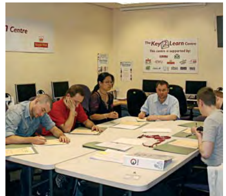
Glasgow learners get tips on accessing higher education