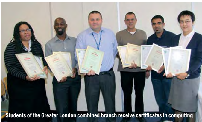
Students of the Greater London combined branch receive certificates in computing