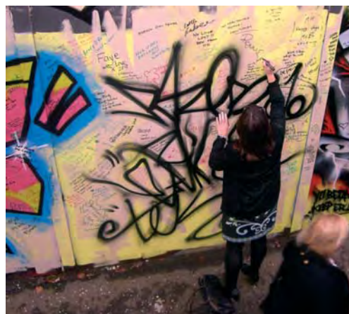
Above: The so-called 'peace' walls have divided and disadvantaged the Belfast community

This is where the CWU comes in. We have members living within these divided communities who have a strong commitment to assist in whatever way