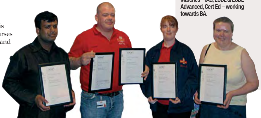
Below: Learners from Penarth Road Learning Centre Cardiff (RM) receiving their CLAIt certificates

The most recent project, Ymlaen Gilan Gilydd (Forward Together), is working towards achieving sustainability, and Wales National Learning Committee (WNLC) and a strong network of active ULRs are developing themselves to ensure they can deliver the best learning opportunities to members.